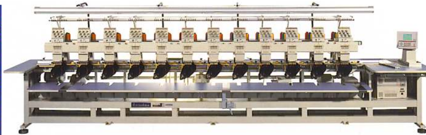
Available in two sewing head configurations – 12 and 15-heads.

Macpherson Meistergram has been in the embroidery machine business for well over half a century. We have the experience to help your business prosper. Along with offering the finest line of embroidery machines available, Macpherson Meistergram provides you with the friendliest, most efficient service possible. Our technicians and customer service representatives go out of their way to insure customer satisfaction. And, our parts department maintains a complete line of parts and supplies, so you get what you want, when you want it.